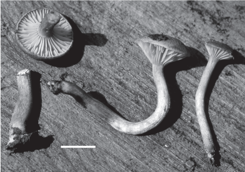
FIG. 1. Basidiomata of Phylloporus colligatus (BRG HOLOTYPE Henkel 8026). Bar = 10 mm.

HYMENOPHORE lamellate. LAMELLAE subdistant, adnate to subdecurrent, 2–3 mm tall, occasionally forking at midpoint, light yellow (4A7–4A8), staining brighter yellow when bruised; edge concolorous, even; lamellulae 1–2. STIPE 30–45 mm long, 2–4 mm wide, equal, curved, dry; upper half glabrous when young, dull orangish (5C6–5C7) throughout; lower half orangish yellow; solid; trama off-white, solid, unchanging. BASAL MYCELIUM pale yellow. ODOR minimal, non-distinctive. TASTE none. SPORE DEPOSIT not obtained (FIG. 1).